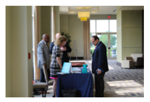
Jahan Chaar Yaar Mil Jayein.....!!